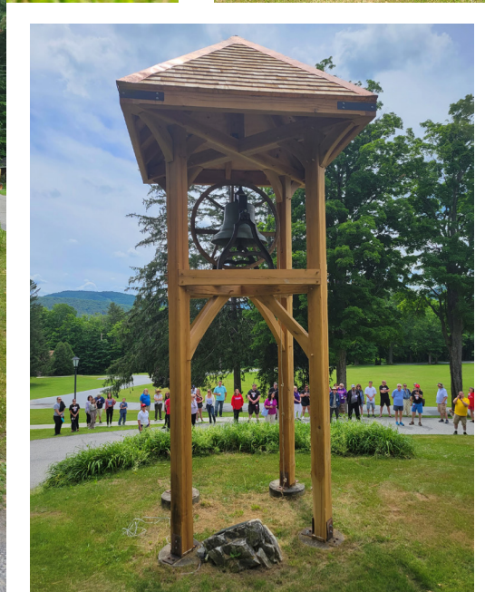
The Bell Tower was officially dedicated during Reunion Weekend 2022. The new post & beam bell tower was constructed with timber harvested from the woods of Hoosac and created by Asa Clark '01 with design aid from students and faculty