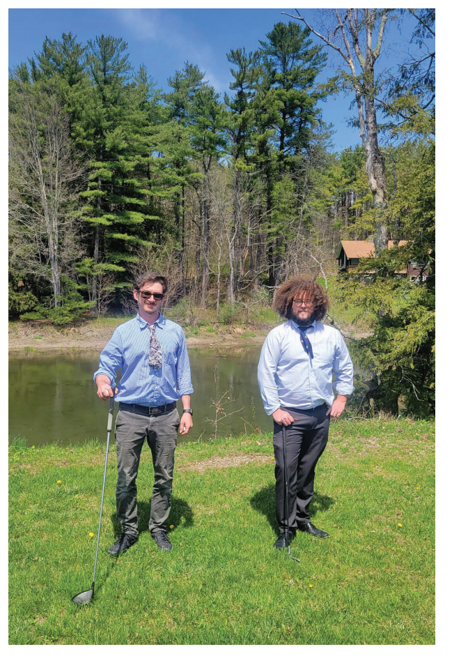
Art and literary faculty enjoy a spring round of golf on the lawn.