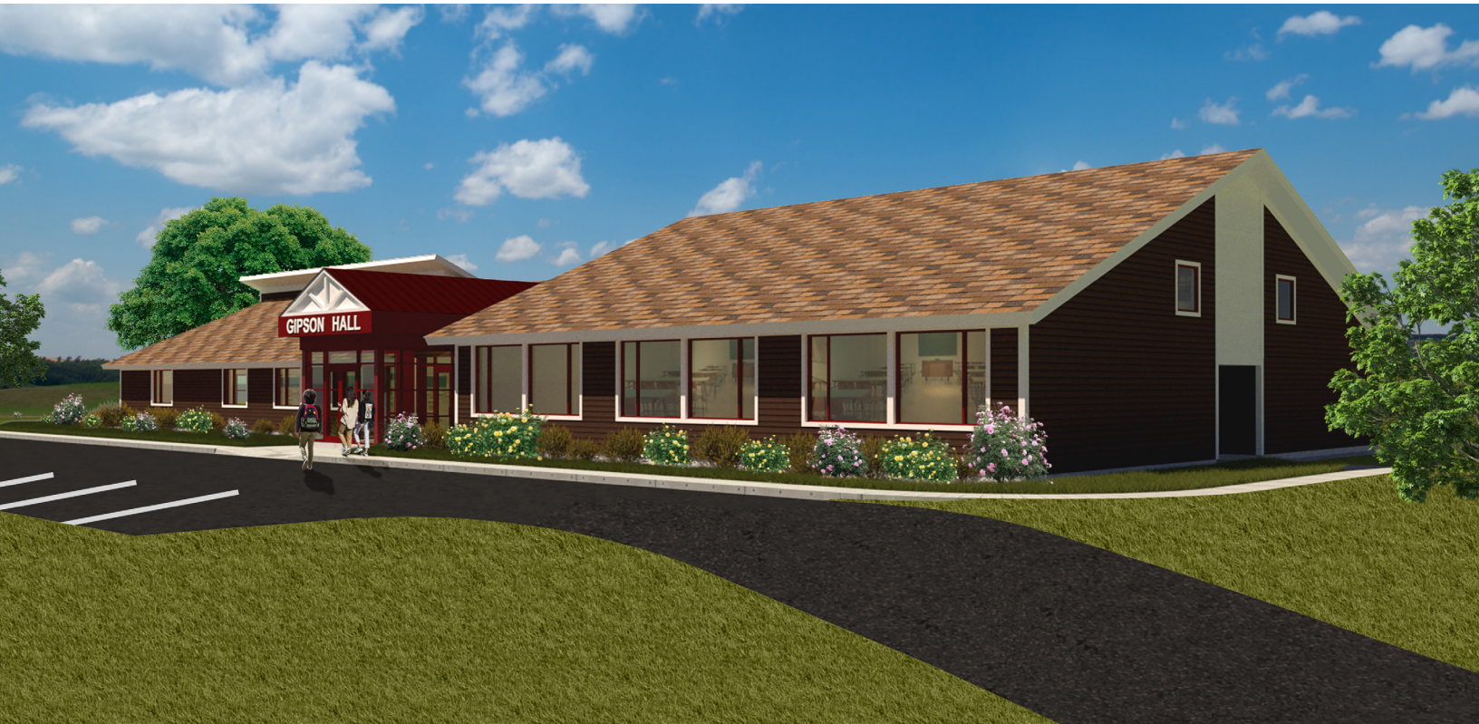
Hoosac School Gipson Hall